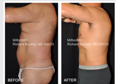
Laser Liposculpture of Abs, Waist, Hips at MilfordMD Cosmetic Dermatology in Milford, PA